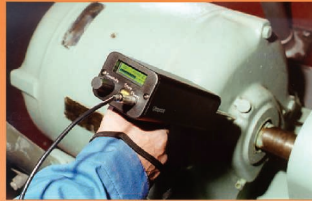
Test bearing condition