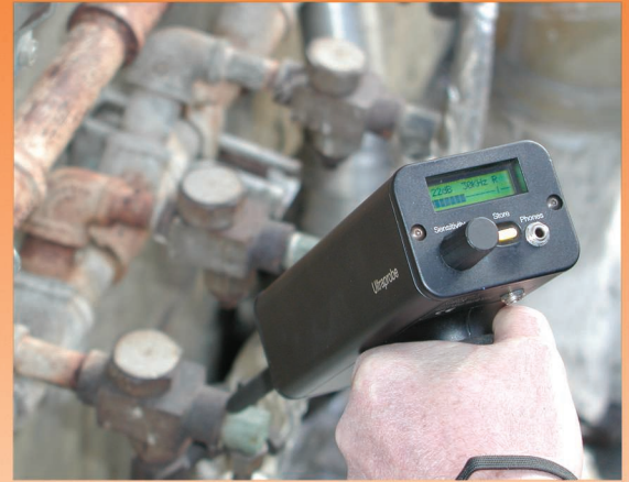
Inspect steam traps