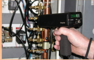
Detect air leaks